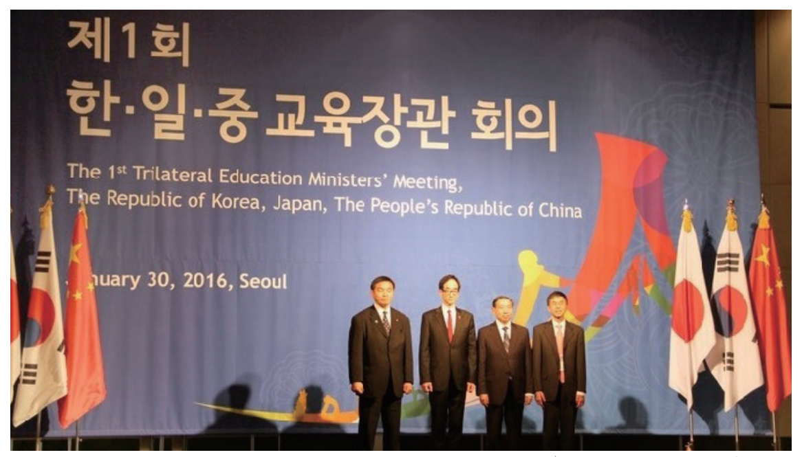
1<sup>st</sup> Trilateral Education Ministers' Meeting

The 1<sup>st</sup> Trilateral Education Ministers' Meeting was held in Seoul, ROK on January 30, 2016. The meeting, inaugurated based on the agreement made during the 6<sup>th</sup> Trilateral Summit, highlighted the significance of human exchange and cooperation in the field of education. During the meeting, the three Ministers discussed the issues of 1) strengthening trilateral education cooperation, 2) education for fostering creative talent, 3) expansion of CAMPUS Asia Program, and 4) education reform trends in each country. The Ministers signed the Seoul Declaration for Trilateral Education Cooperation which states the agreements made between the three parties during the meeting. The 2<sup>nd</sup> Trilateral Education Ministers' Meeting to be held in 2017 will be hosted in Japan.