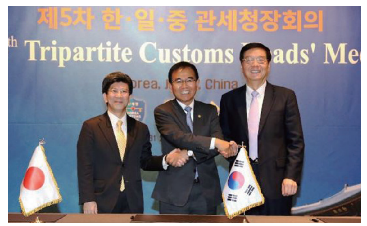
5<sup>th</sup> Tripartite Customs Heads' Meeting

On the occasion of the 6th Trilateral Summit, the 5th Tripartite Customs Heads' Meeting (TCHM) was held in Seoul, ROK on October 31, 2015 in attendance with the three heads of Korea Customs Service; the Customs and Tariff Bureau of Ministry of Finance of Japan; and the General Administration of Customs of China. At the 5th TCHM, which was held for the first time in four years, the three heads exchanged opinions on common topics such as trade facilitation, IPR infringement and illicit drug trafficking. "Joint Statement on Customs Cooperation on Trade Facilitation" was issued together with the Joint Declaration of the 6th Trilateral Summit.