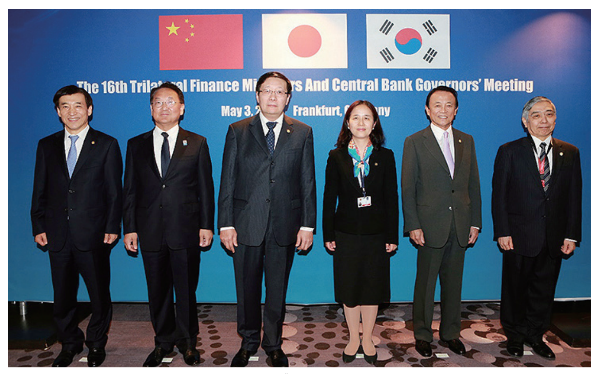
16<sup>th</sup> Trilateral Finance Ministers and Central Bank Governors' Meeting

After the 14<sup>th</sup> Trilateral Finance Ministers and Central Bank Governors' Meeting in May 2015, the 15<sup>th</sup> and 16<sup>th</sup> Meeting was held respectively on October 8, 2015 in Lima, Peru; and on May 3, 2016 in Frankfurt, Germany, in attendance with the Ministries of Finance and Central Banks from the three countries. At the aforementioned Meetings, the Finance Ministers and Central Bank Governors exchanged views on the latest development of global economy and regional financial cooperation such as ASEAN+3 as well as cooperation under the G20. The 17<sup>th</sup> Meeting will be held in May 2017, in Yokohama, Japan.