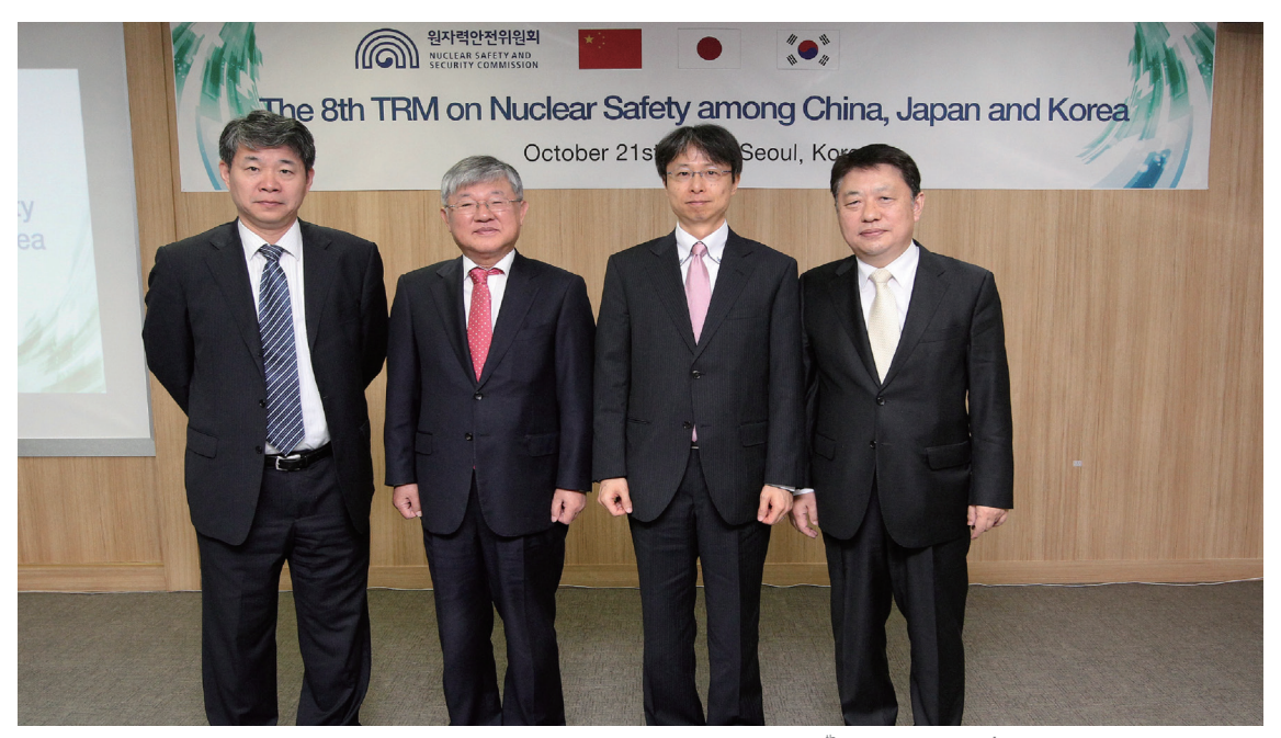
8<sup>th</sup> Top Regulators' Meeting on Nuclear Safety

The 8<sup>th</sup> Top Regulators' Meeting (TRM) on Nuclear Safety among the Nuclear Safety and Security Commission of the ROK (NSSC), the Ministry of Environmental Protection of China/the National Nuclear Safety Administration (MEP/NNSA) and the Nuclear Regulation Authority of Japan (NRA) was held in Seoul, ROK on October 21, 2015. At the meeting, the three authorities exchanged updates on regulatory activities in each country. Furthermore, detailed safety regulations of the three countries were reviewed during the technical session. The three authorities reaffirmed to strengthen trilateral cooperation in this field and confirmed the progress of three working groups in order to fulfill the "Implementation of Action Items" which was agreed upon in the 6<sup>th</sup> TRM. The three authorities shared progress as well as future plans of the Working Group on Human Resource Development (WGHRD) and the Working Group on Online Information Sharing (WGOIS) and also agreed to establish the Working Group on Emergency Preparedness and Response (WGEPR). The three authorities agreed to hold the 9<sup>th</sup> TRM in China in 2016.