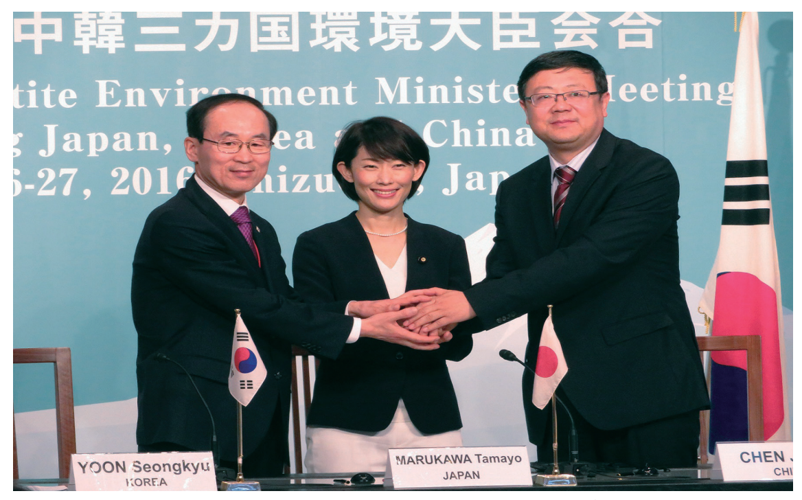
18th Environment Ministers' Meeting

The 18<sup>th</sup> Tripartite Environment Ministers' Meeting (TEMM18) was held among the Ministry of the Environment of Japan, the Ministry of Environment of the Republic of Korea (Korea), and the Ministry of Environmental Protection of China on April 27, in Shizuoka, Japan. At the meeting, the three ministers introduced the latest development of environmental policies in each country, discussed major policies to address global and regional environmental issues such as 2030 Agenda for Sustainable Development and the Paris Agreement. Ministers also reviewed progress on 9 priority areas of the Tripartite Joint Action Plan on Environmental Cooperation (2015-2019). The MOU of Tripartite Cooperation Network for Environmental Pollution Prevention and Control Technologies was signed by three ministries, under the witness of the ministers. On the occasion of TEMM18, the Tripartite Roundtable on Environmental Business, themed "Active Role of Environmental Industry in the Regional Transition to Green Economy," and the Youth Forum, themed "Nature's Benefit to People," were held among business and youth representatives from the three countries.