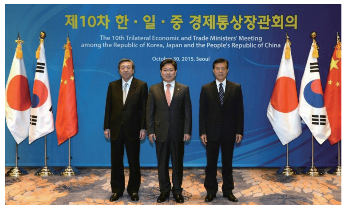
10<sup>th</sup> Trilateral Economic and Trade Ministers' Meeting

The 10<sup>th</sup> Trilateral Economic and Trade Ministers' Meeting was held among the Ministry of Trade, Industry and Energy (MOTIE) of the ROK, the Ministry of Economy, Trade and Industry (METI) of Japan, and the Ministry of Commerce (MOFCOM) of China on October 30, 2015 in Seoul, ROK, for the first time in three and half years. At the meeting, the three ministers exchanged in-depth discussions on the topics such as CJK FTA and RCEP negotiations; cooperation in multilateral frameworks like WTO, G20 and APEC; Creative Economy; SMEs; Intellectual Property; energy; and fourth-party-market etc.