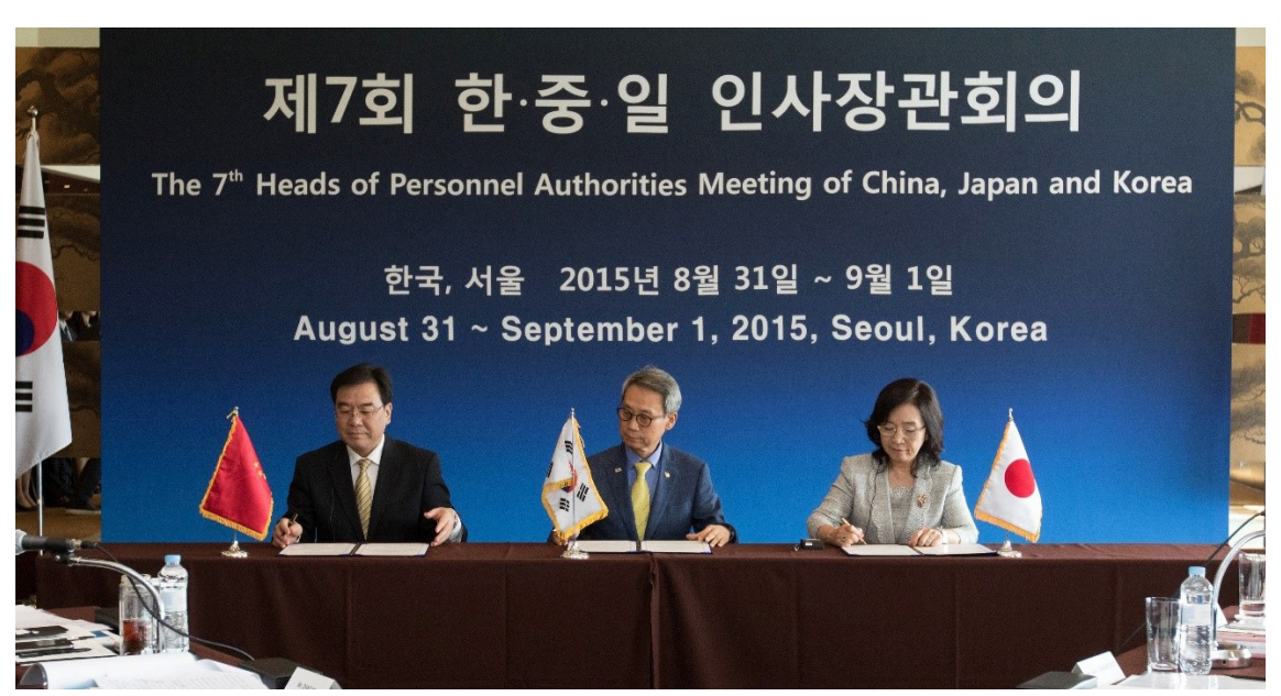
7<sup>th</sup> Heads of Personnel Authorities Meeting

The 7<sup>th</sup> Heads of Personnel Authorities Meeting was convened in Seoul, ROK on September 1, 2015. The meeting was chaired by Minister of Personnel Management of the Republic of Korea and attended by Vice Minister of Personnel Management of the Republic of Korea and attended by Vice Minister of Human Resources and Social Security of China and President of the National Personnel Authority of Japan.