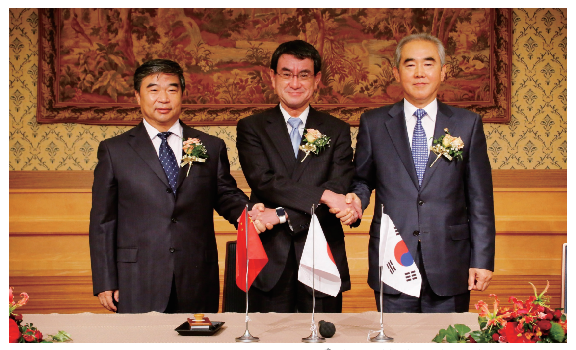
4^{\text{th}} Trilateral Ministerial Meeting on Disaster Management

The 4<sup>th</sup> Trilateral Ministerial Meeting on Disaster Management among the Cabinet Office of Japan, the Ministry of Civil Affairs of China and the Ministry of Public Safety and Security of the ROK was held in Tokyo, Japan on October 28, 2015. At the meeting, the three Ministers shared emergency responses to recent disasters in each country and exchanged views on the future cooperation on disaster management among the three countries. The three Ministers signed the "Trilateral Joint Statement on Disaster Management Cooperation" and decided to discuss and proceed the cooperation from two aspects: 1) promoting the implementation of Sendai Framework for Disaster Risk Reduction (SFDRR), and 2) education and training. The 5<sup>th</sup> Meeting will be held in China in 2017.