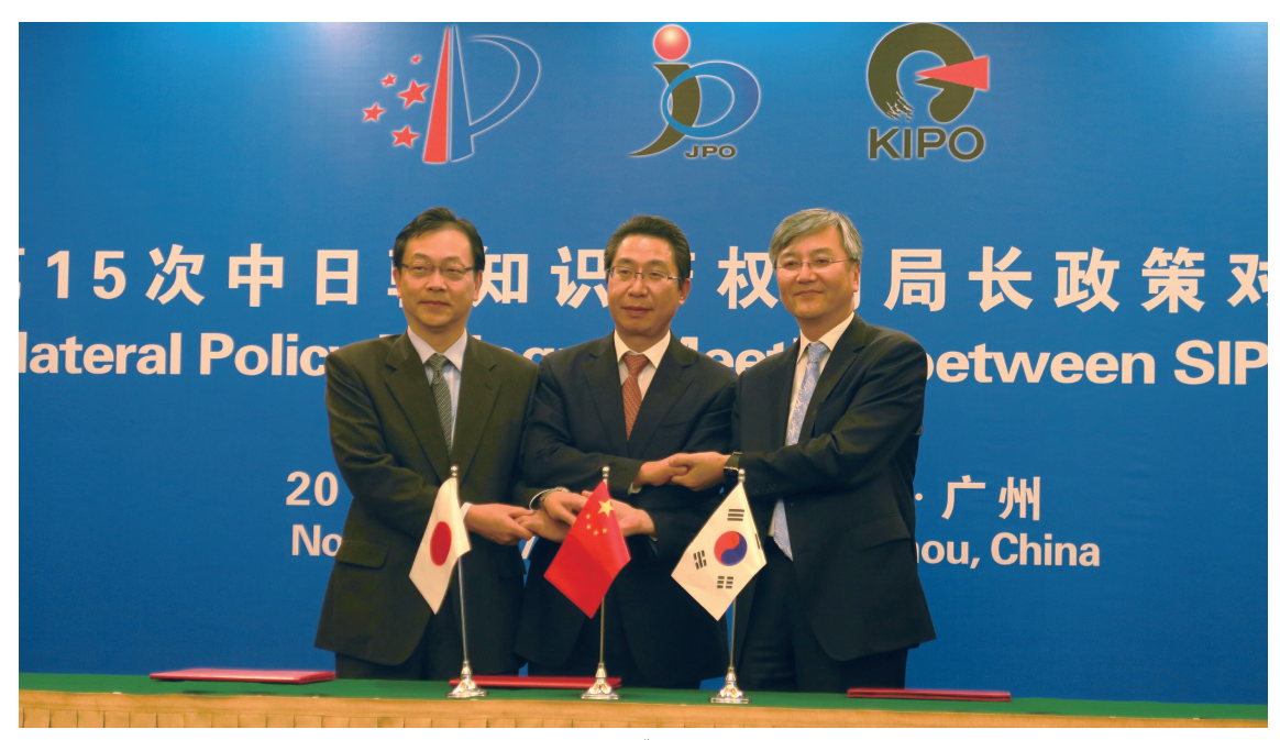
15<sup>th</sup> Trilateral Policy Dialogue Meeting among SIPO, JPO and KIPO

The 15<sup>th</sup> Trilateral Policy Dialogue Meeting among the State Intellectual Property Office of P.R. China (SIPO), the Japan Patent Office (JPO) and the Korean Intellectual Property Office (KIPO) was held in Guangzhou, China on November 17, 2015.