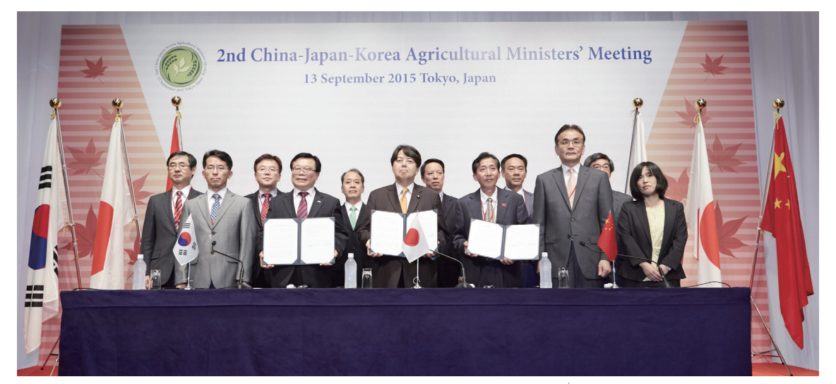
2<sup>nd</sup> Trilateral Agricultural Ministers' Meeting

The 2<sup>nd</sup> Trilateral Agricultural Ministers' Meeting (TAMM) was held in Tokyo, Japan on September 13, 2015 with the participation of the Ministry of Agriculture, Forestry and Fisheries of Japan, the Ministry of Agriculture of China, and the Ministry of Agriculture, Food and Rural Affairs of the ROK. The three ministries exchanged discussions on 1) food security, 2) animal and plant diseases, 3) natural disasters and climate change, 4) biomass energy development, 5) agricultural scientific and technological cooperation, 6) the 6<sup>th</sup> industrialization of agriculture, 7) CJK FTA agricultural negotiations, 8) agricultural cooperation within global and regional multilateral frameworks, and 9) senior official meeting mechanism. As a result of their discussions, the three ministers adopted and signed the "Joint Communiqué of the Second TAMM" and "Memorandum of Cooperation (MOC) on Response against Transboundary Animal Diseases."