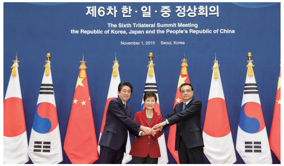
6<sup>th</sup> Trilateral Summit

The 6 <sup>th</sup> Trilateral Summit was convened in Seoul, ROK on November 1, 2015 for the first time in three and a half years, completely restoring the trilateral cooperation process. During the Summit, chaired by the ROK, the Leaders had discussions on the current status as well as the future directions for a wide range of cooperation issues. The Leaders also reaffirmed the importance of trilateral cooperation in East Asian region and decided to continue their joint efforts to address regional as well as global challenges at large.