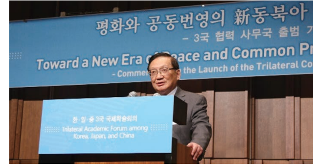
TANG, Jiaxuan Former State Councilor of China