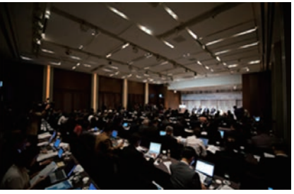
Attendants Over 200 government dignitaries, scholars, business leaders, journalist and civil society leaders