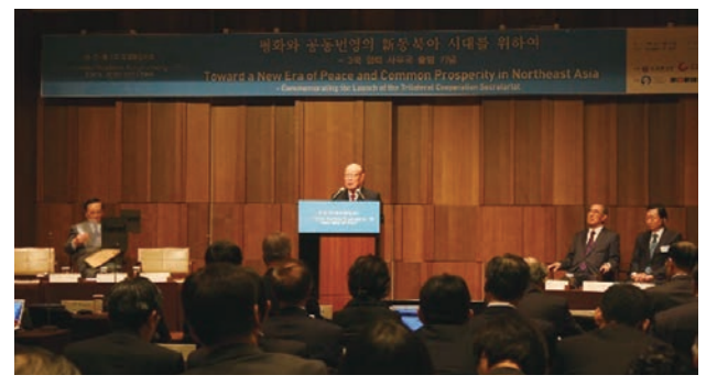
GONG, Ro-myung Former Minister of MOFAT, Chairman of Sejong Foundation