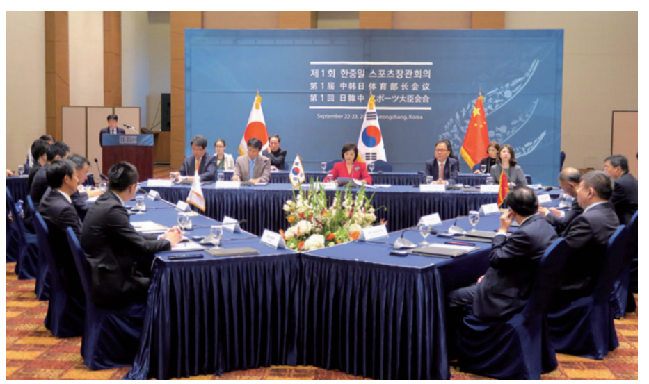
1<sup>st</sup> Trilateral Sports Ministers' Meeting

Sports Ministers' Meeting Expert Forum was hosted by the ROK Ministry of Culture, Sports and Tourism, Korea Sport Industry Association, and Korea Sports Promotion