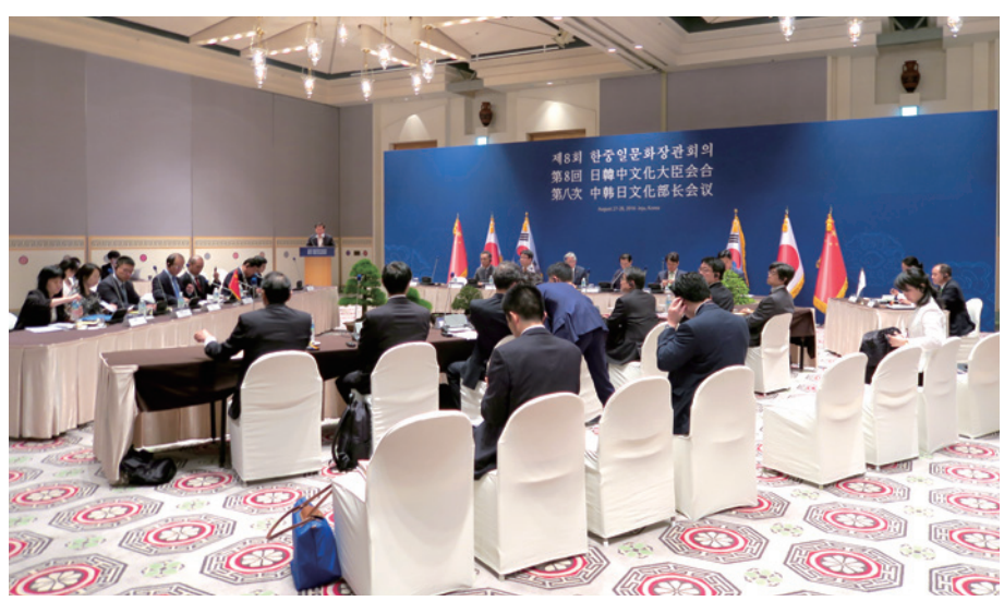
8<sup>th</sup> Trilateral Culture Ministers' Meeting

The Trilateral Culture & Arts Education Forum 2016 was convened in Seoul, the ROK on May 24, 2016 with the participation of 250 people, including panelists from