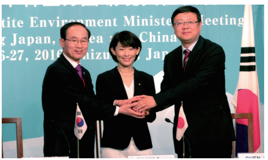
18<sup>th</sup> Tripartite Environment Ministers' Meeting (TEMM18)

The 18th Tripartite Environment Ministers' Meeting (TEMM18) was held among Ministry of the Environment of Japan, Ministry of Environment of the ROK, and Ministry of Environmental Protection of China in Shizuoka, Japan on April 27, 2016. At the meeting, the three ministers introduced the latest development of environmental policies in each country, discussed major policies to address global and regional environmental issues such as "2030 Agenda for Sustainable Development" and the "Paris Agreement". Ministers also reviewed progress on the 9 priority areas of the "Tripartite Joint Action Plan on Environmental Cooperation (2015-2019)". The "MOU of Tripartite Cooperation Network for Environmental Pollution Prevention and Control Technologies" was signed by the three ministries. On the occasion of TEMM18, the Tripartite Roundtable on Environmental Business, themed "Active Role of Environmental Industry in the Regional Transition to Green Economy", and the Youth Forum, themed "Nature's Benefit to People", were held among business and youth representatives from the three countries.