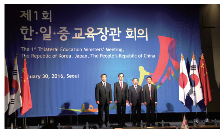
1<sup>st</sup> Trilateral Education Ministers' Meeting

The 1st Trilateral Rectors' Forum was held in Seoul, the ROK on December 13, 2016,