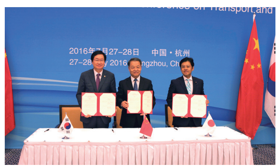
6<sup>th</sup> Trilateral Ministerial Conference on Transport and Logistics

The 6<sup>th</sup> China-Japan-Korea Ministerial Conference on Transport and Logistics was held in Hangzhou, China on July 28, 2016 with the participation of Mr. YANG Chuantang, Minister of Transport of the People's Republic of China; Mr. KIM Youngsuk, Minister of Oceans and Fisheries of the ROK; and Mr. MIYAUCHI Hideki, Parliamentary Vice-Minister of Land, Infrastructure, Transport and Tourism of Japan.