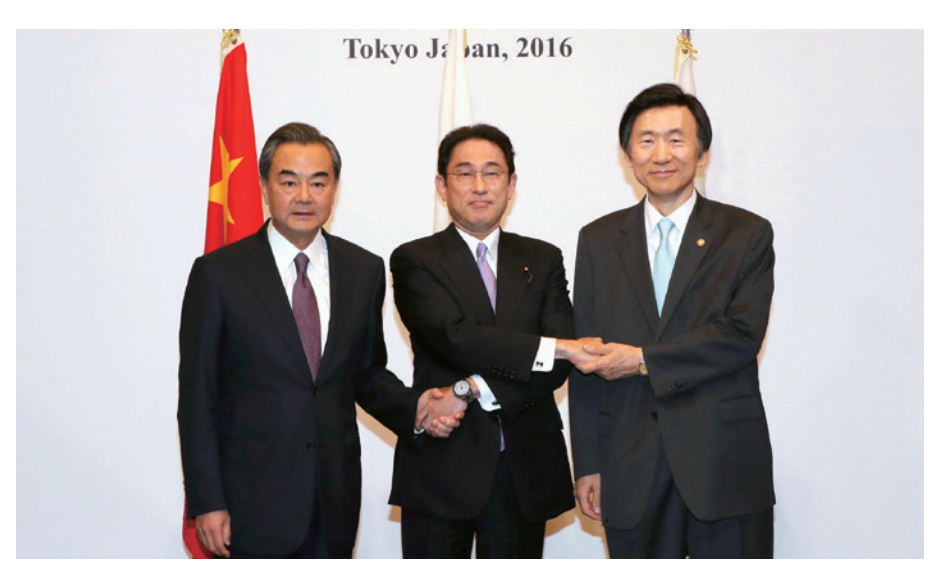
8<sup>th</sup> Trilateral Foreign Ministers' Meeting

As for regional and international issues, the ministers exchanged views on the situation of Korean Peninsula, calling for both regional and international commitments in this regard. The ministers also agreed to push forward trilateral cooperation on the occasions of multilateral meetings including G20, ASEAN+3, EAS and APEC Summit scheduled in the latter half of this year.