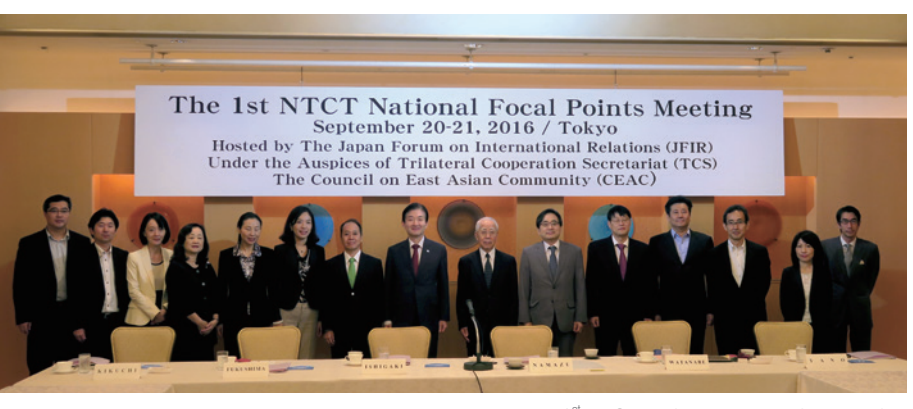
1<sup>st</sup> NTCT National Focal Points Meeting

Diplomatic Academy (KNDA). At the meeting, the participants exchanged views on the importance of enhancing trilateral think-tanks cooperation. They also discussed the mechanism and operation of the NTCT and agreed to hold the meeting of the NTCT annually on a rotational basis, as well as to strengthen cooperation in organizing seminars, conducting joint research projects, increasing mutual exchange, etc. The TCS, as a facilitator of the trilateral cooperation, also participated in the meeting and was tasked to play a secretariat role in developing the NTCT in the future.