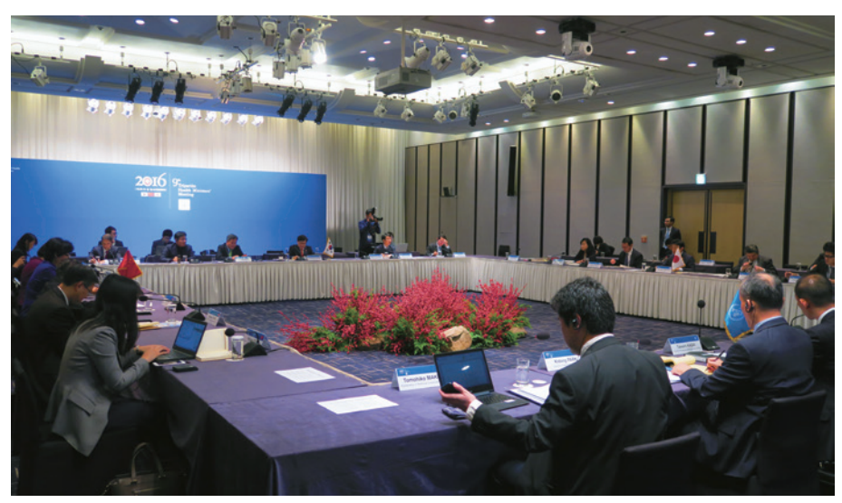
9<sup>th</sup> Tripartite Health Ministers' Meeting

was held as the side event of the meeting on December 3 with a view to enhancing emergency preparedness and response against pandemic influenza and emerging/re-emerging infectious disease through effective information sharing among the quarantine authorities of the three countries.