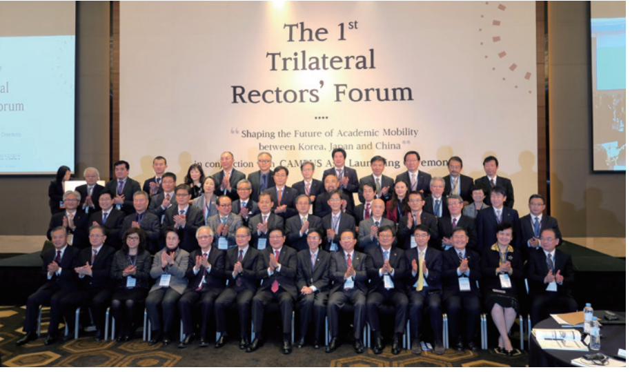
1<sup>st</sup> Trilateral Rectors' Forum