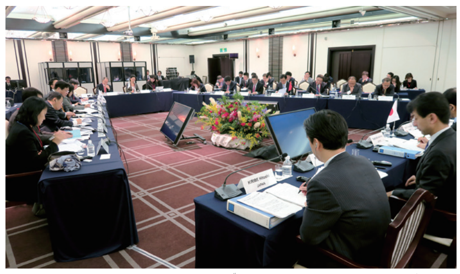
11th Trilateral Economic and Trade Ministers' Meeting

The 11<sup>th</sup> Trilateral Economic and Trade Ministers' Meeting was held among Ministry of Economy, Trade and Industry (METI) of Japan, Ministry of Commerce (MOFCOM) of China, and Ministry of Trade, Industry and Energy (MOTIE) of the ROK on October 29, 2016 in Tokyo, Japan. At the meeting, the three ministers exchanged in-depth discussions on the topics such as China-Japan-Korea Free Trade Agreement (CJK FTA) and Regional Comprehensive Economic Partnership (RCEP) negotiations; cooperation in multilateral frameworks like WTO, G20 and APEC; e-commerce; Olympics and Paralympics; Supply Chain Connectivity (SCC); fourth-country market and energy.