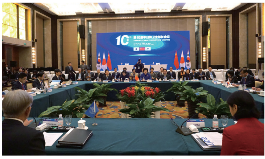
10<sup>th</sup> Tripartite Health Ministers' Meeting

The 11<sup>th</sup> Korea-China-Japan Forum on Communicable Disease Control and Prevention was held in Seoul, the ROK on November 7, 2017. Representatives from Korean Centers for Disease Control and Prevention (KCDC), Chinese Centers for Disease Control and Prevention (China CDC) and National Institute of Infectious Diseases (NIID) of Japan attended the forum and exchanged the ideas on the agendas of avian influenza A (H7N9), severe fever with thrombocytopenia syndrome (SFTS), dengue fever and Zika fever, and their efforts for infectious disease control in the region.