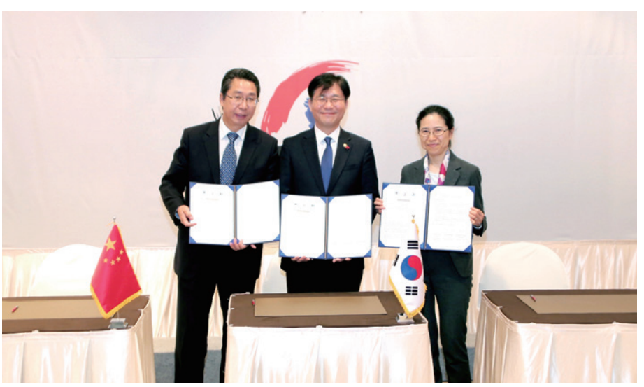
17<sup>th</sup> TRIPO Heads Meeting

The 8<sup>th</sup> Korea-China-Japan Design Forum was held in Seoul, the ROK on May 16, 2017. Under the theme of "Legal protection of Character Designs", representatives from IP offices of China, Japan, and the ROK and experts from private sectors of the