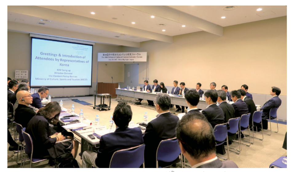
10<sup>th</sup> Trilateral Culture Content Industry Forum

theme of "Dance, Connect, Surpass". In addition, Culture City of East Asia Summit was held on August 26, inviting the delegations from the 15 previous, present, and future cultural cities among the three countries.