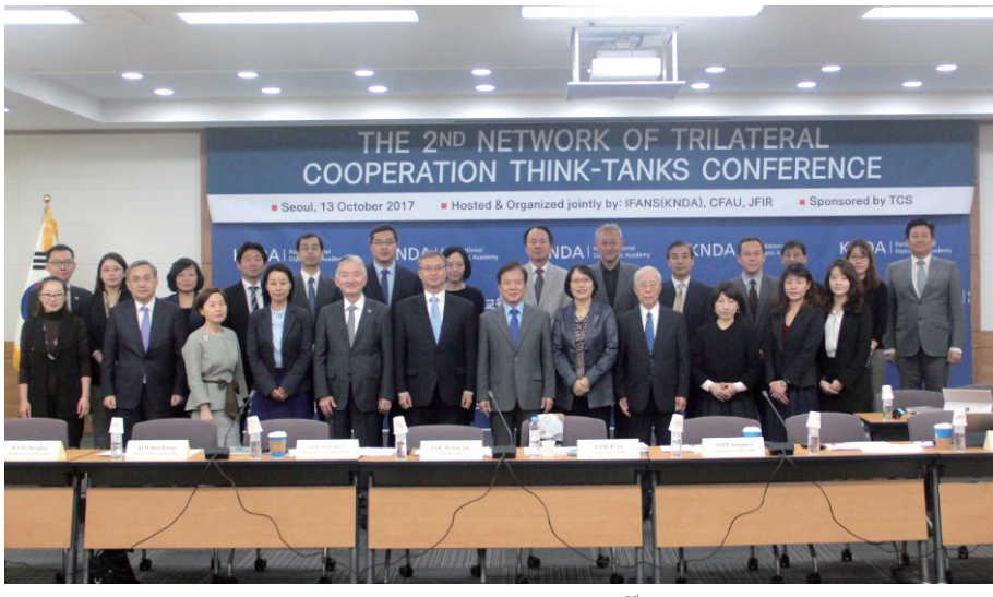
2<sup>nd</sup> NTCT National Focal Points Meeting

Korea, China and Japan", and "Environmental Cooperation between Korea, China and Japan". Distinguished scholars from the three countries shared their insights and offered recommendations on pressing issues in the region, ranging from Northeast Asian security to trilateral economic and environmental cooperation.