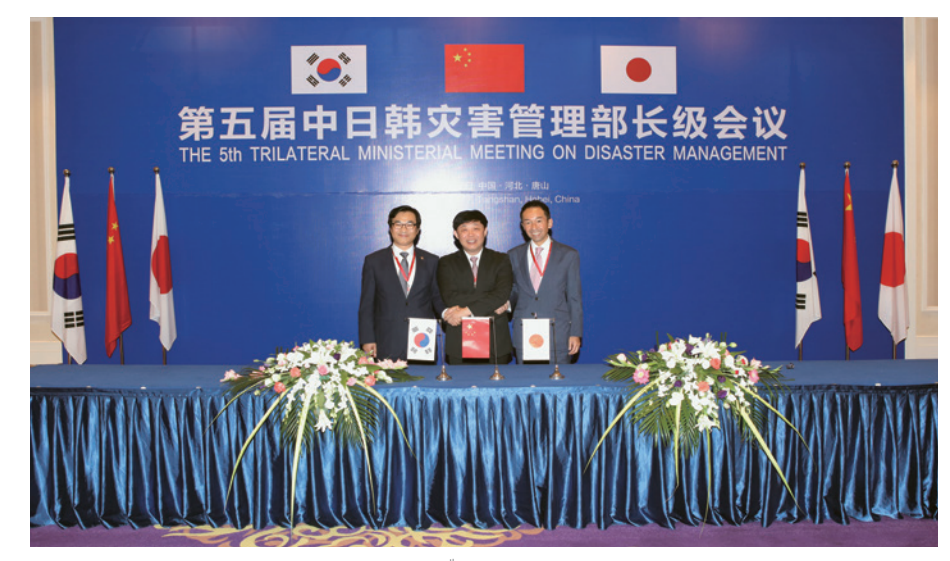
5<sup>th</sup> Trilateral Ministerial Meeting on Disaster Management

The 5<sup>th</sup> Trilateral Ministerial Meeting on Disaster Management among Ministry of Civil Affairs of China, Ministry of Public Safety and Security of the ROK, and Cabinet Office of Japan was held in Tangshan, China on September 7, 2017.