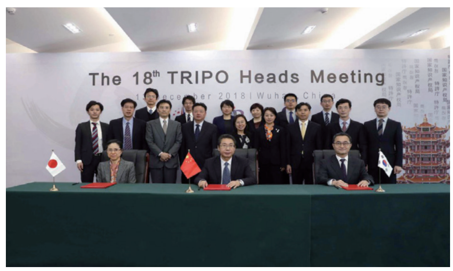
18th TRIPO Heads Meeting

three offices introduced each country's current status and had in-depth discussions on various topics for trilateral cooperation activities regarding the fields of trials and appeals, designs, and development of human resources. Moreover, the three offices shared a common view to emphasize and further strengthen trilateral cooperation among them. The 6<sup>th</sup> TRIPO User Symposium was held on the same day after the 18<sup>th</sup> TRIPO Heads Meeting.