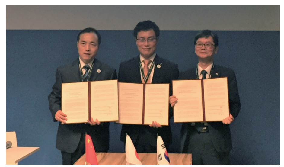
3<sup>rd</sup> Trilateral Ministerial Meeting on Water Resources

The 3<sup>rd</sup> Trilateral Ministerial Meeting on Water Resources among Ministry of Land, Infrastructure, Transport and Tourism of Japan, Ministry of Water Resources of China, and Ministry of Land, Infrastructure and Transport of the ROK was held on March 19, 2018 in Brasilia, Brazil on the occasion of the 8<sup>th</sup> World Water Forum. The three ministers presented each country's domestic and international efforts to achieve water-related Sustainable Development Goals and discussed measures to promote trilateral cooperation in the water sector.