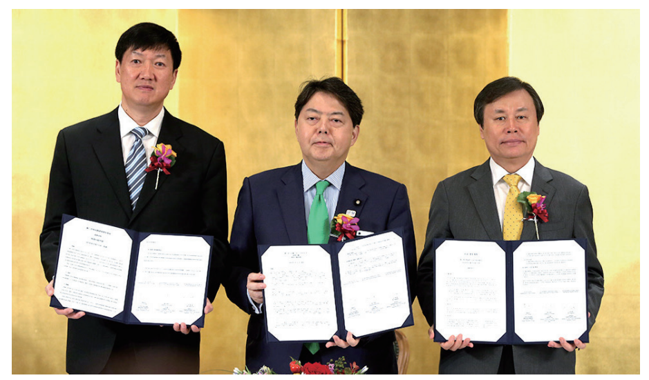
2<sup>nd</sup> Trilateral Sports Ministers' Meeting