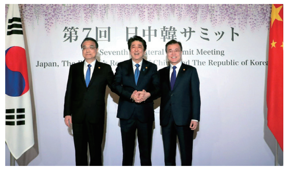
7<sup>th</sup> Trilateral Summit

After the Summit, "Joint Declaration of the Seventh Japan-China-ROK Trilateral Summit" was adopted along with the Annex on the list of trilateral meetings since November 2015. Especially appreciating and welcoming the "Panmunjeom Declaration" agreed at the historic 2018 Inter-Korean Summit, which confirmed their common goal of the complete denuclearization of and the establishment of a permanent peace regime on the Korean Peninsula in accordance with relevant United Nations Security Council Resolutions, the leaders also adopted "Joint Statement on the '2018 Inter-Korean Summit' by the Leaders of Japan, the People's Republic of China and the Republic of Korea".