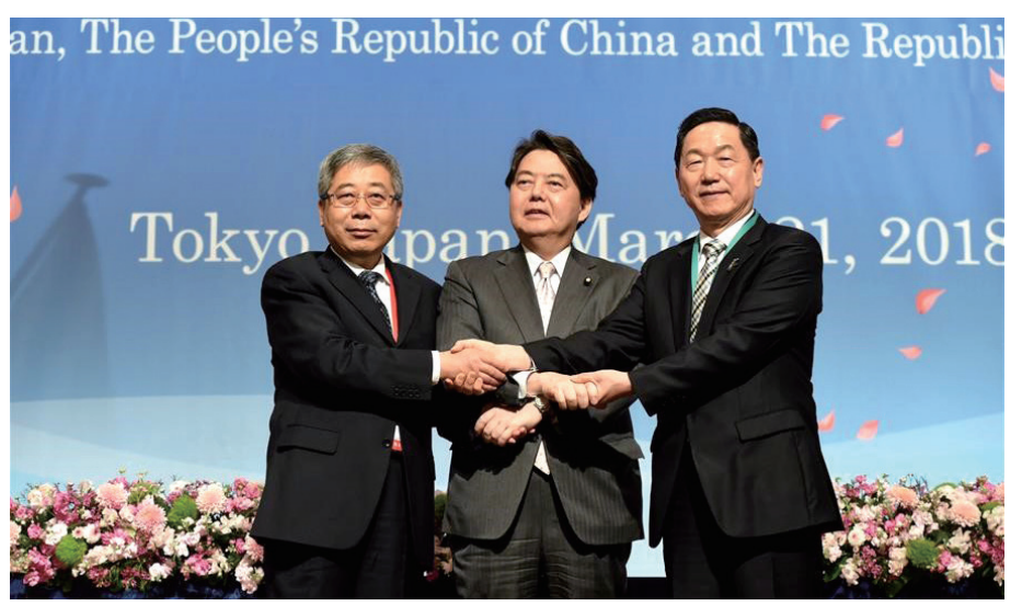
2<sup>nd</sup> Trilateral Education Ministers' Meeting

The 2<sup>nd</sup> Trilateral Education Ministers' Meeting was held in Tokyo, Japan on March 21, 2018. The meeting was presided by the Minister of Ministry of Education, Culture, Sports, Science and Technology (MEXT) of Japan. The Minister of Ministry of Education of China and the Minister of Ministry of Education of the ROK joined the meeting. During the meeting, the ministers reviewed the progress made in line with the "Seoul Declaration for Trilateral Education Cooperation" from the 1<sup>st</sup> Education Ministers' Meeting held in 2016. Building upon this discussion, the ministers agreed to 1) promote and expand student exchanges among the three countries, 2) further cooperation in higher education through CAMPUS Asia Program and by developing a joint research project on mutual recognition of degrees, and 3) strengthen the network with multilateral partnerships through UNESCO, ASEAN+3, Trilateral Summit and ASEM.