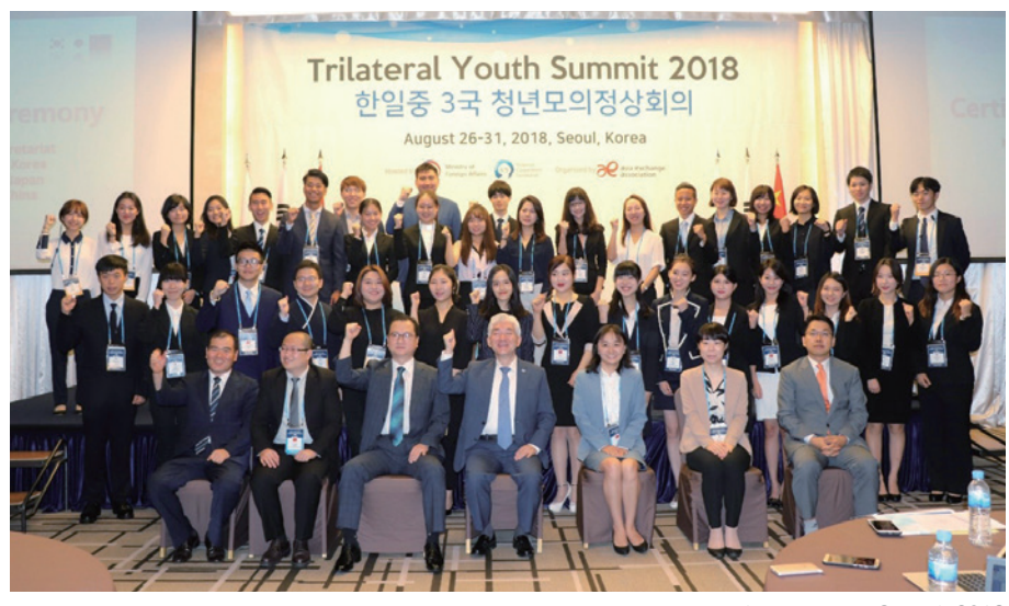
Trilateral Youth Summit 2018

dust and air pollution), 2) Economic Committee (TC towards Trilateral FTA), and 3) Cultural Committee (TC for successful Olympic Games in Northeast Asia). Through lectures, delegation meetings, and committee meetings, the students adopted a Joint Statement during the model summit.