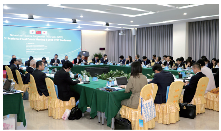
3<sup>rd</sup> NTCT National Focal Points Meeting

At the 3<sup>rd</sup> NTCT National Focal Points Meeting, representatives from the three national focal points and the TCS exchanged views on the work plan of NTCT in 2019 and the role of the TCS in further promoting NTCT and the trilateral cooperation. At the 2018 NTCT Conference, scholars from the three countries shared their insights on future trilateral cooperation in 3 Sessions under the themes of "Trilateral Cooperation in the New Security Context", "Trilateral Cooperation in East Asian Economic Cooperation and Integration" and "Trilateral Cooperation in Fourth Market: '3+X' as a New Approach". Based on in-depth analyses and discussions on the current situation of trilateral cooperation as well as regional and international changes, participants proposed meaningful policy suggestions on future regional cooperation in Northeast Asia.