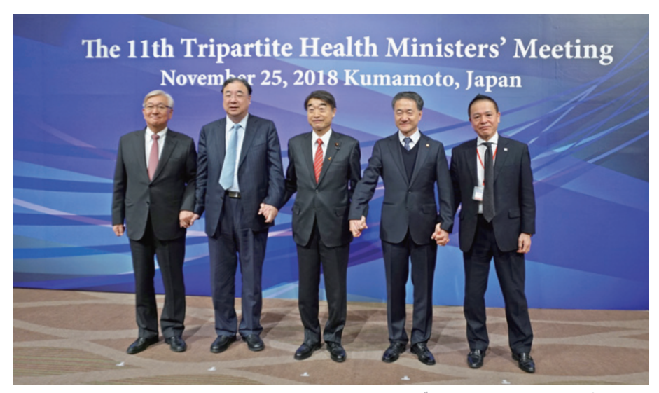
11th Tripartite Health Ministers' Meeting

The 11<sup>th</sup> Tripartite Health Ministers' Meeting was held in Kumamoto, Japan on November 24-25, 2018. The three ministers reviewed the achievements in the past 10 years under the Tripartite Health Ministers' Meeting and exchanged their views toward future cooperation. At the meeting, an active discussion was conducted on three main agendas including 1) infectious disease preparedness and response, 2) healthy aging and non-communicable diseases (NCDs), and 3) universal health coverage (UHC) and disaster health risk management. The meeting adopted the "Joint Statement of the Eleventh Tripartite Health Ministers' Meeting" and was followed by the press conference.