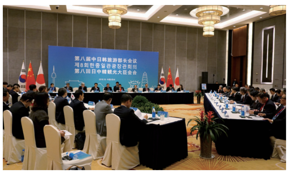
8<sup>th</sup> Trilateral Tourism Ministers' Meeting

The 8<sup>th</sup> Trilateral Tourism Ministers' Meeting was held in Suzhou, China on October 27, 2018. Under the theme of "Promoting sound, stable and sustainable regional cooperation through tourism", the three ministers exchanged their views on 1) improving the level of travel convenience, creating an economically open and integrated China-Japan-Korea cooperation, and strengthening cultural and people-to-people exchanges through expanding the trilateral tourism cooperation, 2) promoting the quality and standardization of regional tourism, actively strengthening youth tourism exchange, and further enhancing the importance of East Asian tourism in the world tourism industry surrounding the theme of "sustainable development", and 3) further deepening the pragmatic cooperation among China, Japan and the ROK through Olympic Games, joint promotion on "Visit East Asia Campaign", and improvement of tourism safety response system. "Suzhou Joint Statement" was adopted at the meeting.