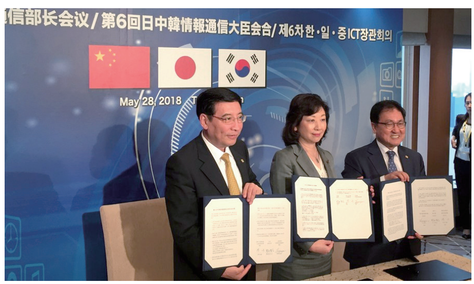
6<sup>th</sup> Trilateral ICT Ministerial Meeting

The 6<sup>th</sup> Trilateral ICT Ministerial Meeting was held in Tokyo, Japan on May 28, 2018. Ministry of Internal Affairs and Communications of Japan, Ministry of