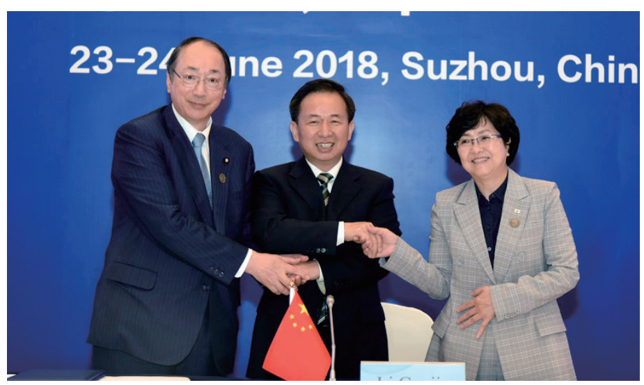
20<sup>th</sup> Tripartite Environment Ministers' Meeting (TEMM20)

As side events of the Ministers' Meeting, the Tripartite Roundtable on Environmental Business themed "Environmentally Sustainable City for Promoting the Transition