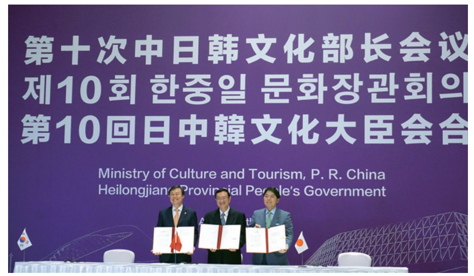
10<sup>th</sup> Trilateral Culture Ministers' Meeting

The 10<sup>th</sup> Trilateral Culture Ministers' Meeting was held in Harbin, China, on August 30, 2018. At the meeting, the three ministers reviewed the progress of the follow-ups of "Qingdao Action Plan", "Jeju Declaration 2016" and "Kyoto Declaration 2017", and acknowledged the achievements made in the field of trilateral cultural cooperation and exchange. Under the recognition of the need to consolidate the future-oriented trilateral relations by promoting cultural exchange in different levels, the ministers signed the "Harbin Action Plan", which stipulated a series of decisions to facilitate cooperation in 1) Culture City of East Asia (CCEA) Program, 2) support and reinforcement for the cooperation of cultural and arts institutions among three countries, 3) joint cultural program during the Olympic and Paralympic Games, and 4) explore possible cooperation in other cultural fields. The ministers at the press conference also announced the designation of Xi'an of China, Toshima of Japan, and Incheon of the ROK as the CCEA 2019.